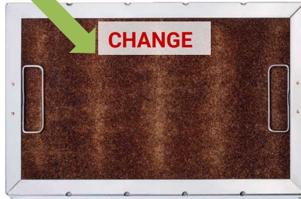
ABOVE GRILL ETC.