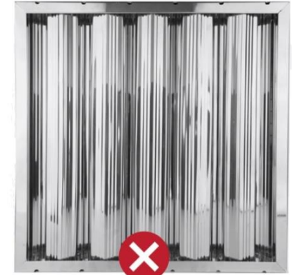
WRONG SIDE UP

GLOVES ARE ADVISABLE WHEN HANDLING FRAMES AS SHARP EDGES ARE SOMETIMES PRESENT