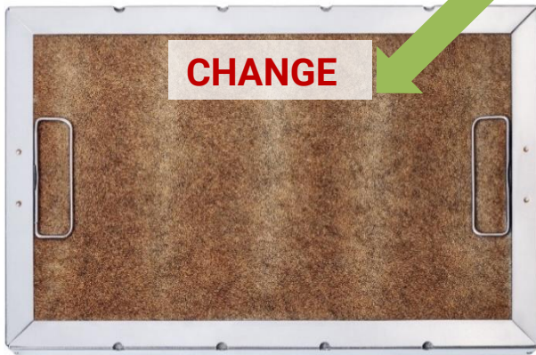
ABOVE FRYER / COMBI